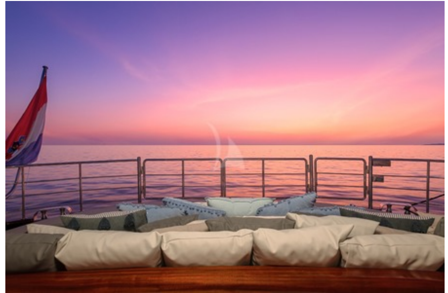
MS Lady Gita - aft lounge