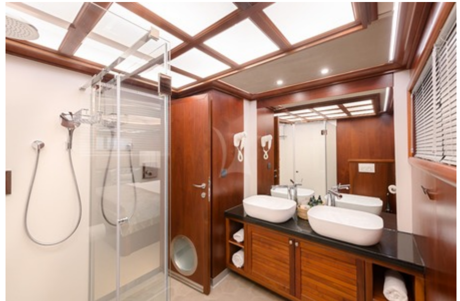
MS Lady Gita - Aft Master cabin bathroom