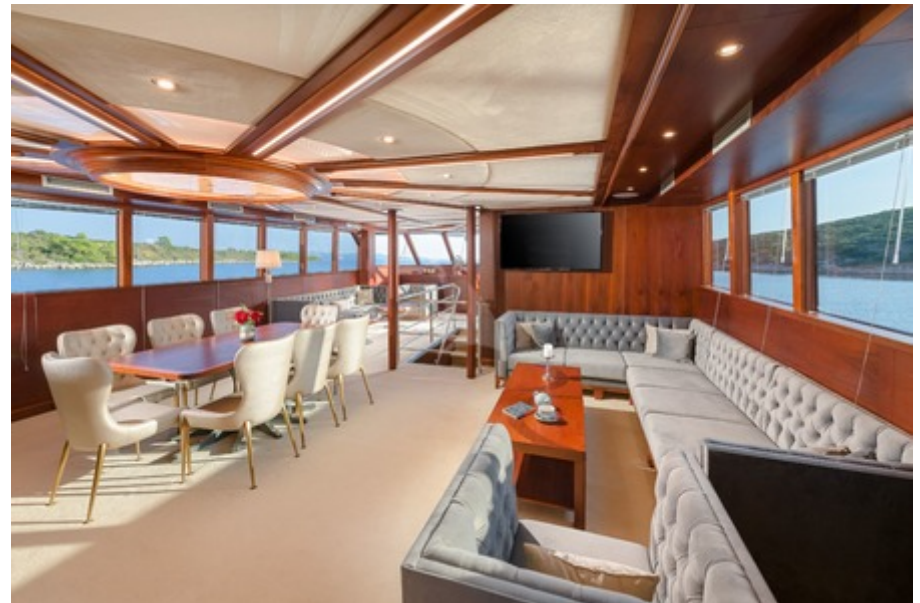
MS Lady Gita - salon