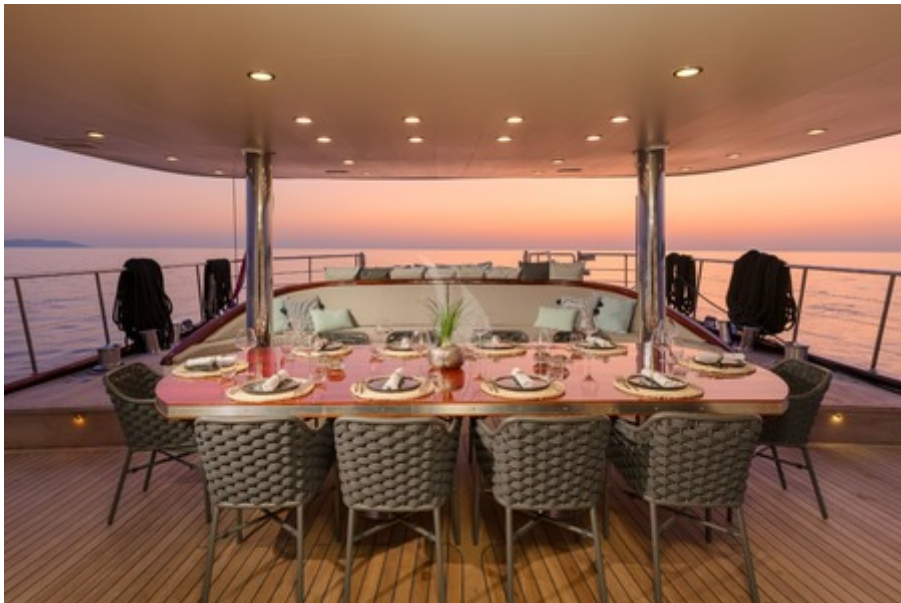
MS Lady Gita - aft dining