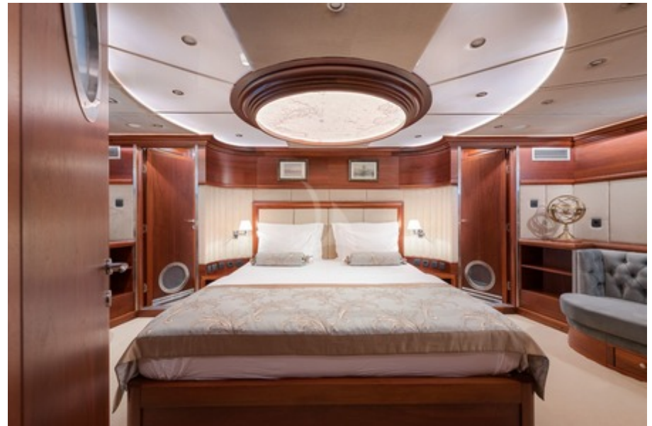
MS Lady Gita - Bow Master cabin