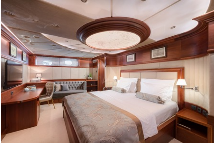
MS Lady Gita - Bow Master cabin