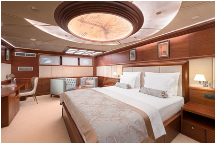
MS Lady Gita - Aft Master cabin