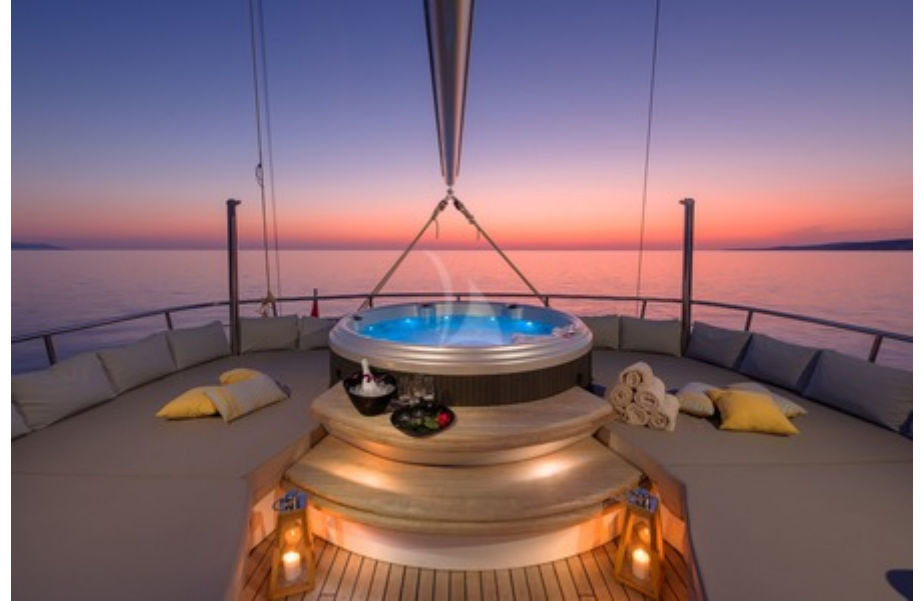
MS Lady Gita - sun deck, Jacuzzi