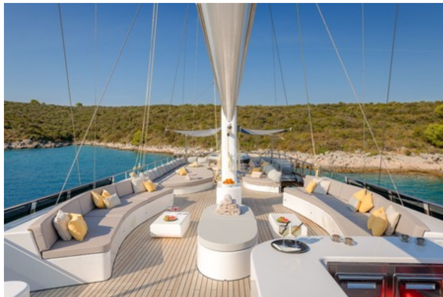
MS Lady Gita, sun deck