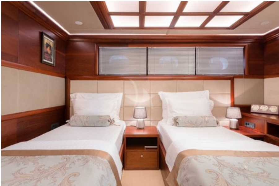
MS Lady Gita - convertible bed cabin No 4 and 5