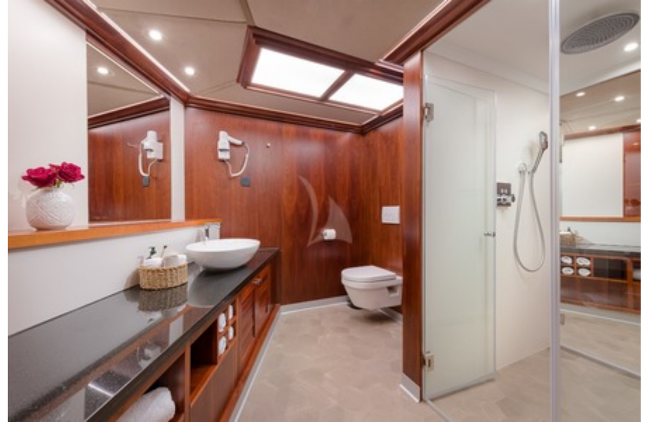
MS Lady Gita - LG Bow Master cabin bathroom