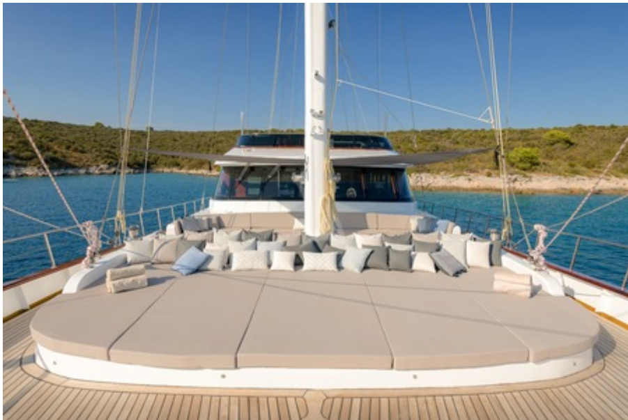
MS Lady Gita - main deck, bow lounge