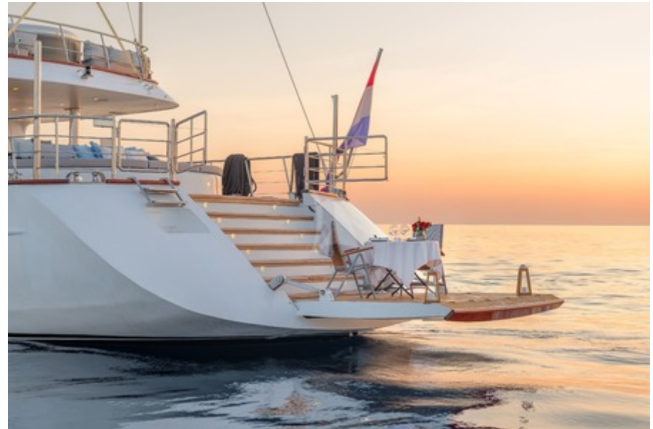
MS Lady Gita - platform