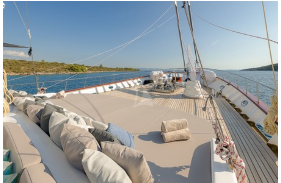
MS Lady Gita - main deck, bow area