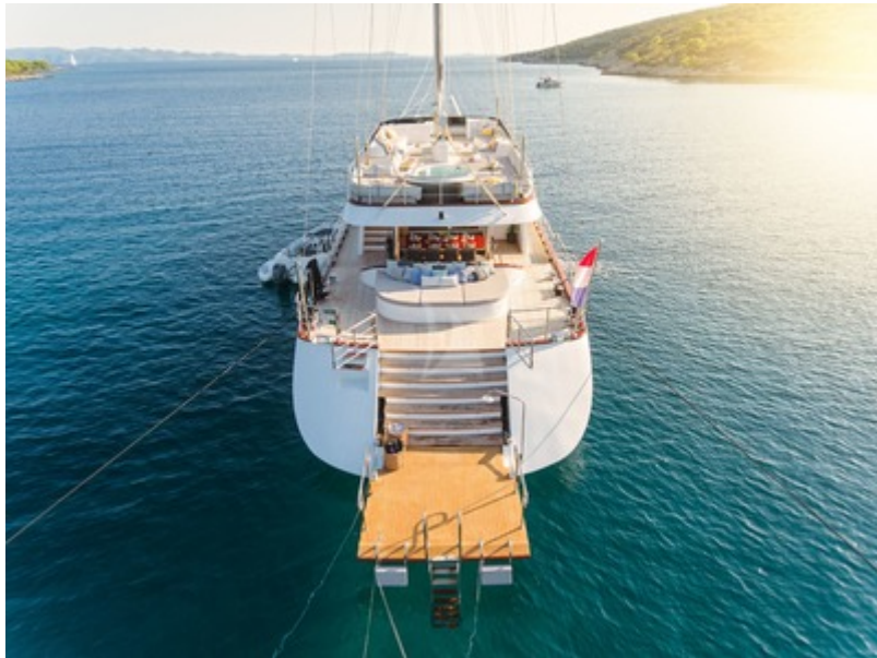
MS Lady Gita, sun deck, main deck, aft area