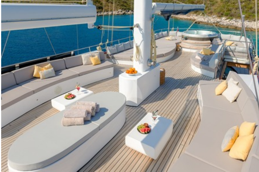
MS Lady Gita, sun deck