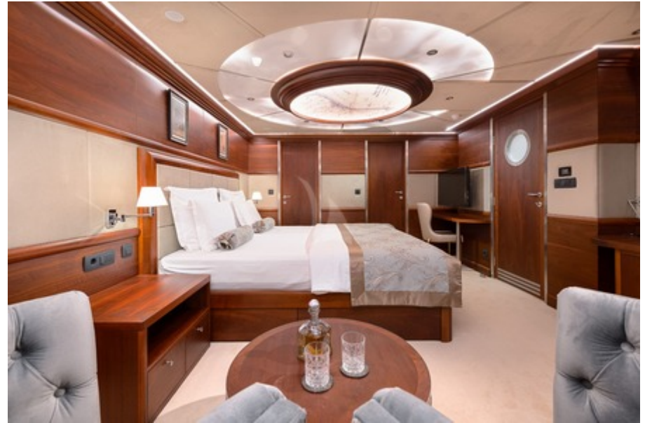
MS Lady Gita - Aft Master cabin